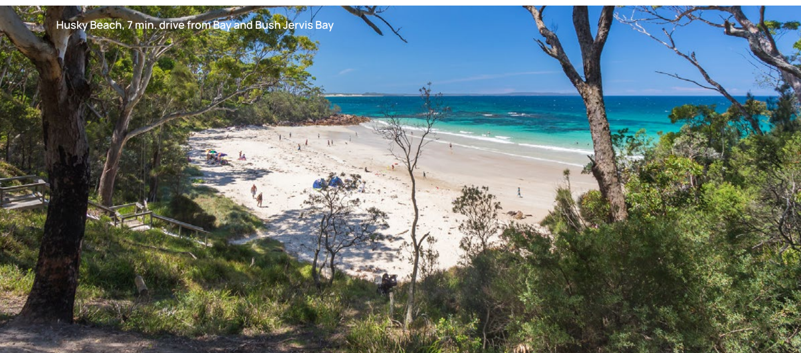
Husky Beach, 7 min. drive from Bay and Bush Jervis Bay

Enquiries → reservations@bayandbush.com.au