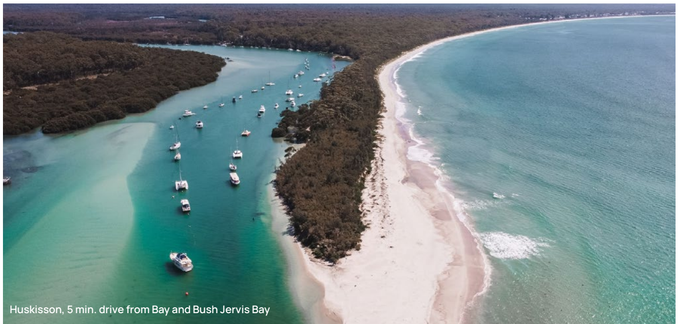
Huskisson, 5 min. drive from Bay and Bush Jervis Bay