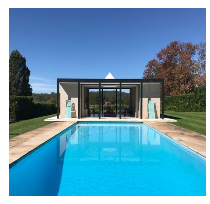
Pool Pavilion designed by renowned modernist architect Guilford Bell