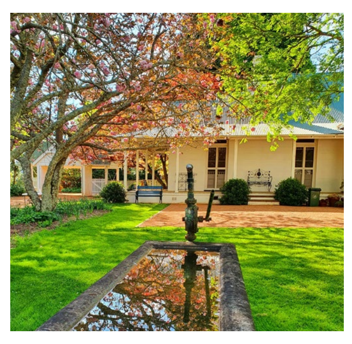
Discover an array of gifts and keepsakes at the White Cottage Gallery and Shop