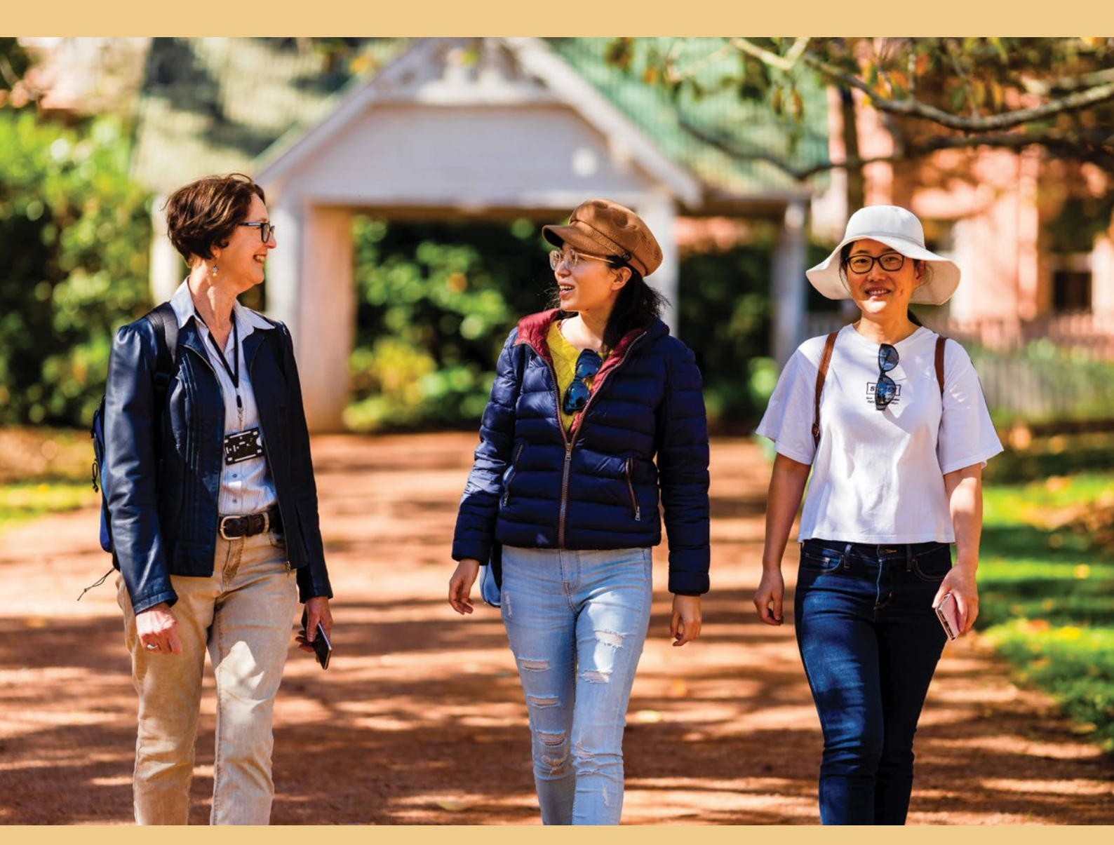
Visitors enjoy the gardens at any time of year

Built in the 1880s, Retford Park is a place of great heritage significance and natural beauty