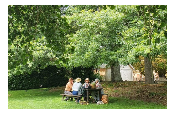
There is something to charm and delight garden enthusiasts and young explorers all seasons of the year

Ask us about local venues for large groups of 40+.