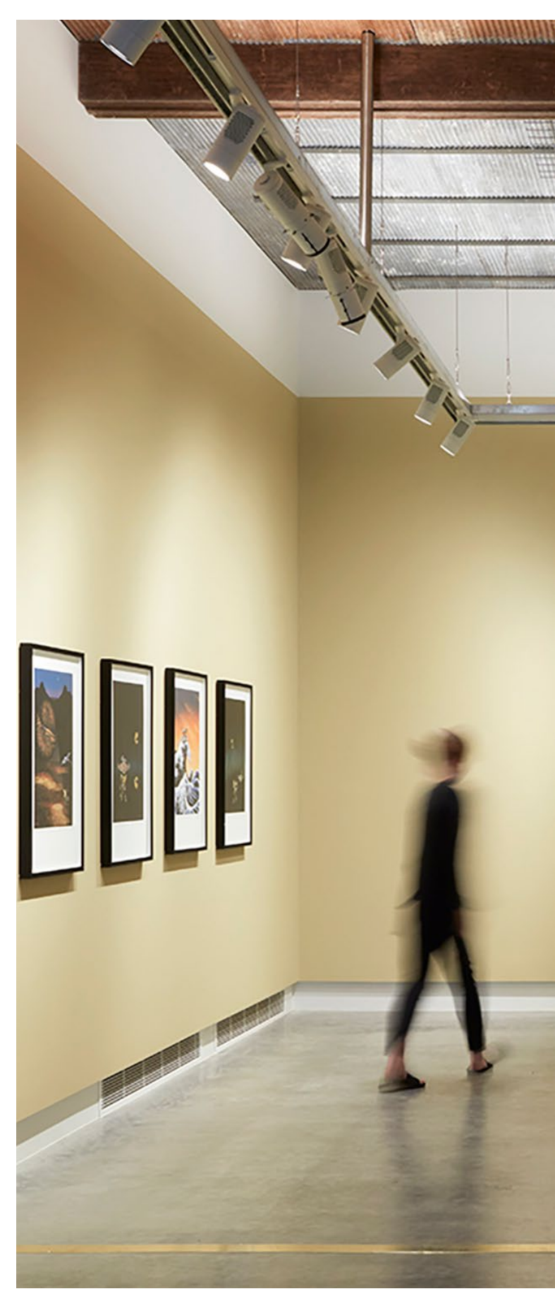
Ngununggula, the Southern Highlands Regional Gallery.

harpersmansion@nationaltrust.com.au nationaltrust.org.au/places/harpers-mansion