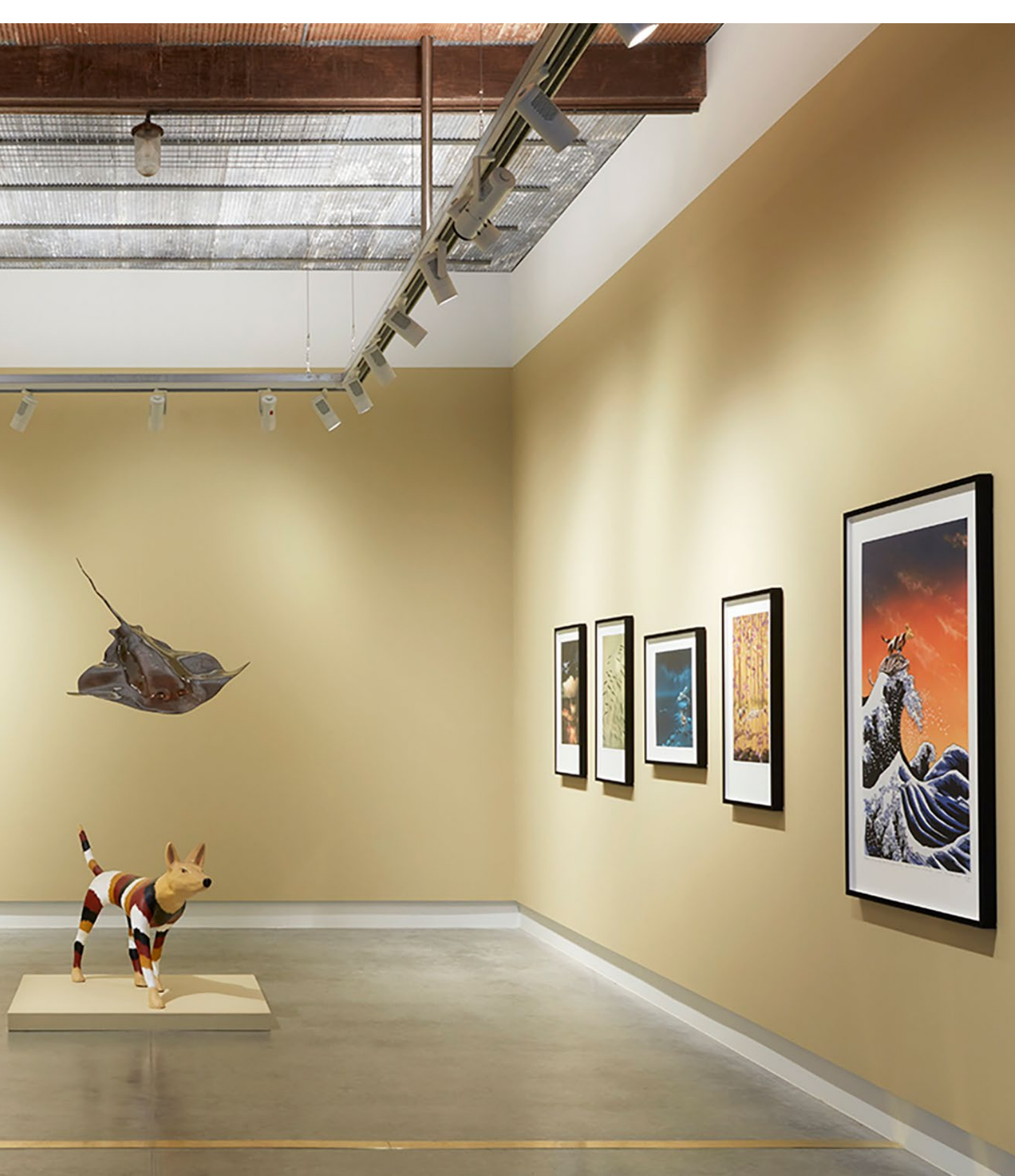
aikha Greer Architects).