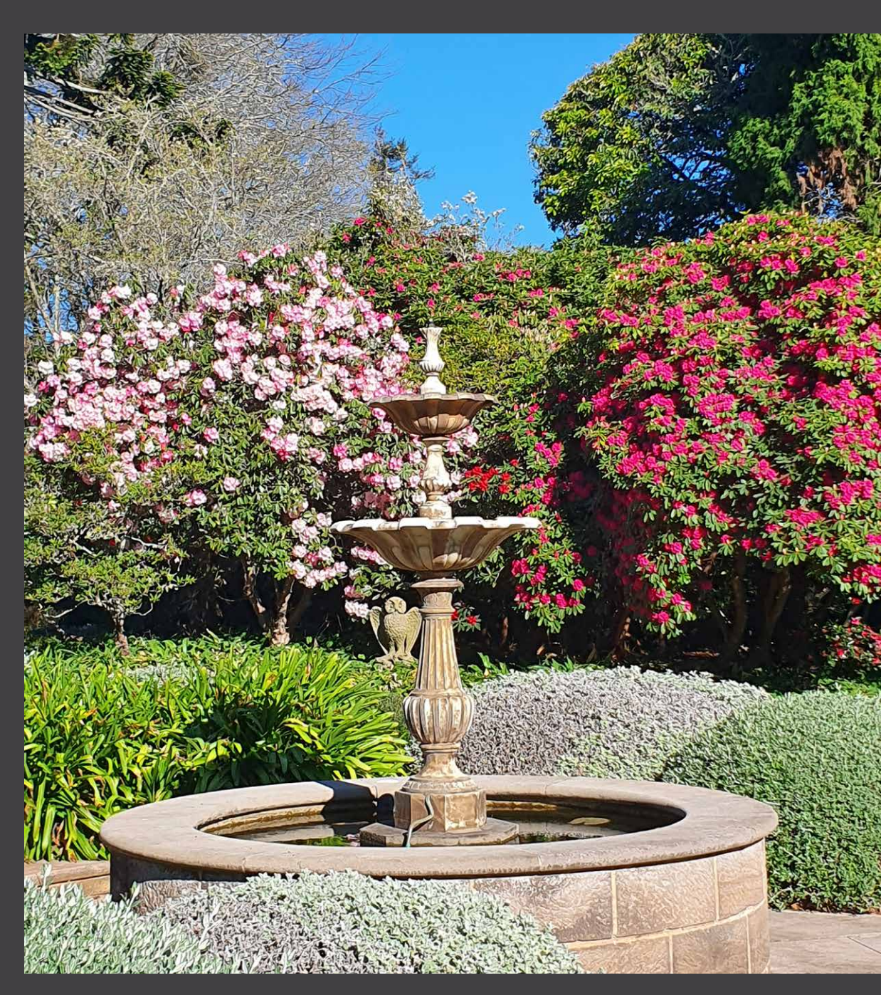
Teardrop garden fountain