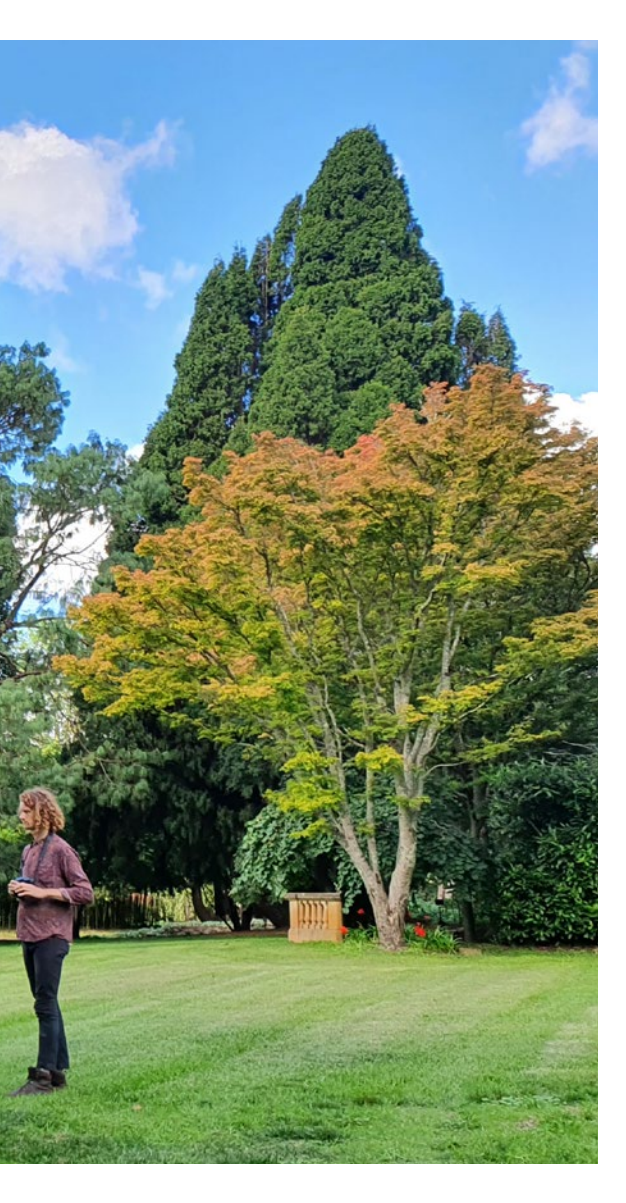
House tours led by passionate guides