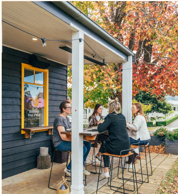
Berry 3/68 Albert St