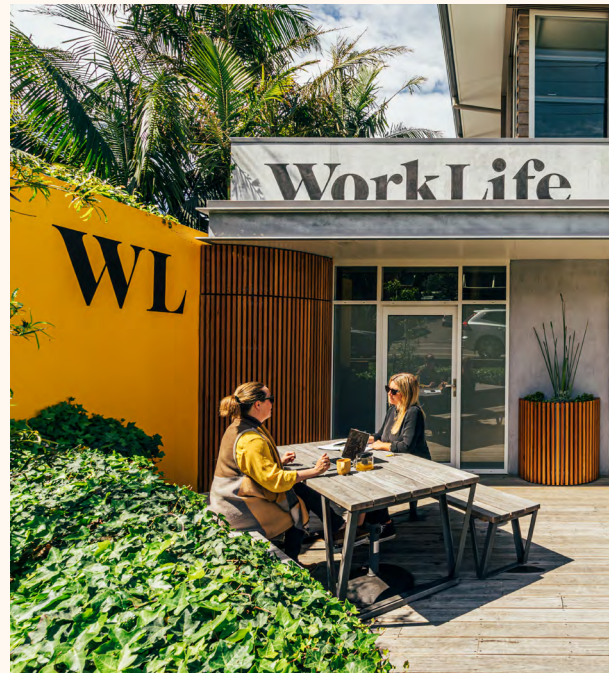
Coledale 741 Lawrence Hargrave Dr