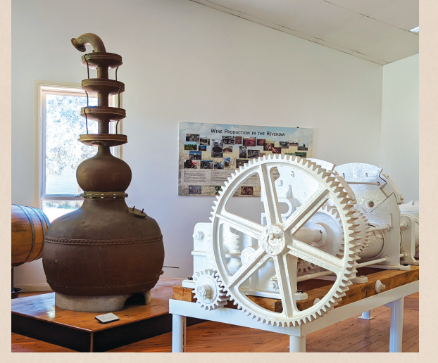
Wine and Irrigation Building

"It is like visiting the Griffith of yesteryear!" Shelandi, Maryland, USA