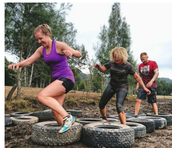
AND SO MUCH MORE...