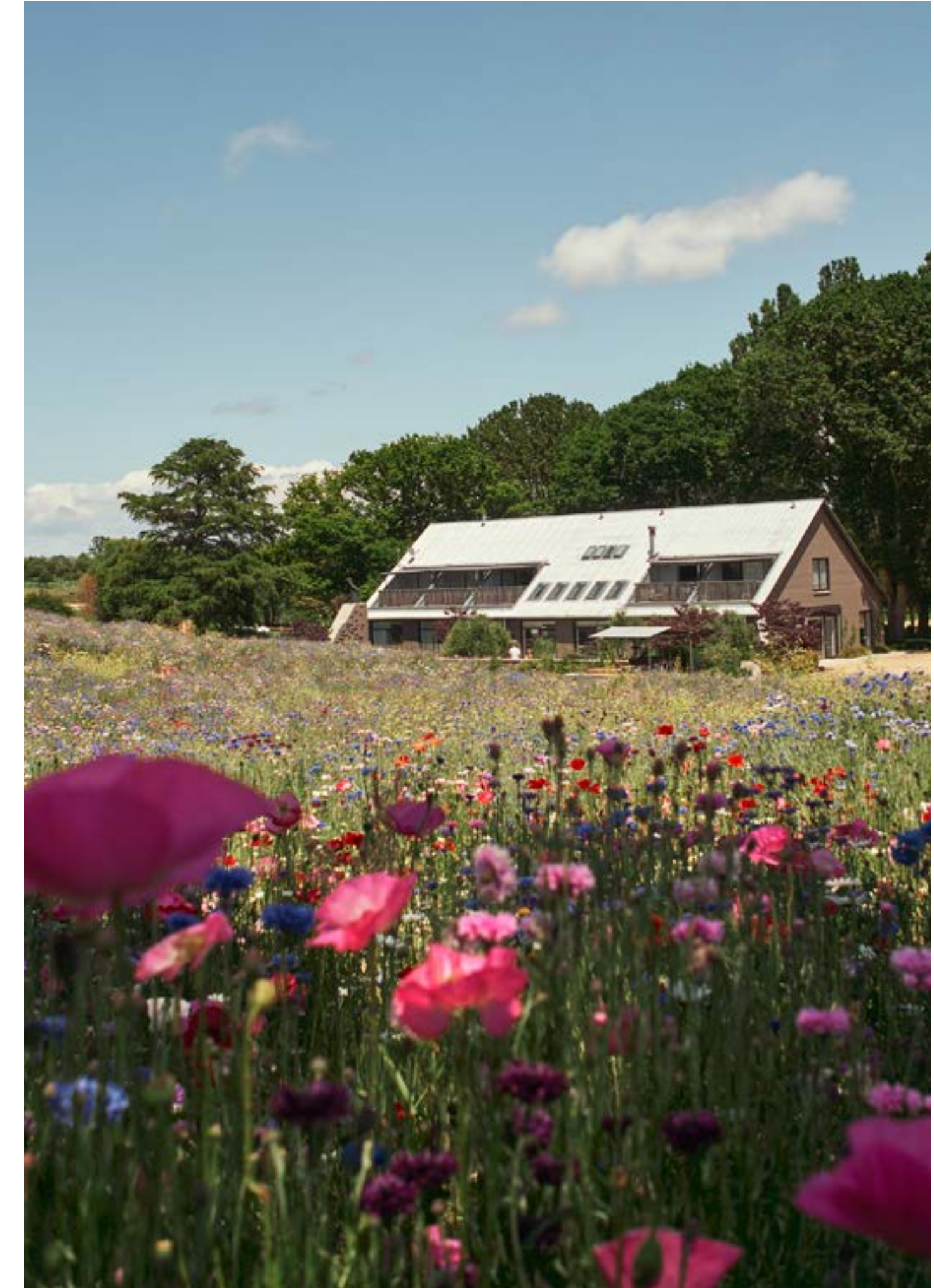
02 / The New Stables