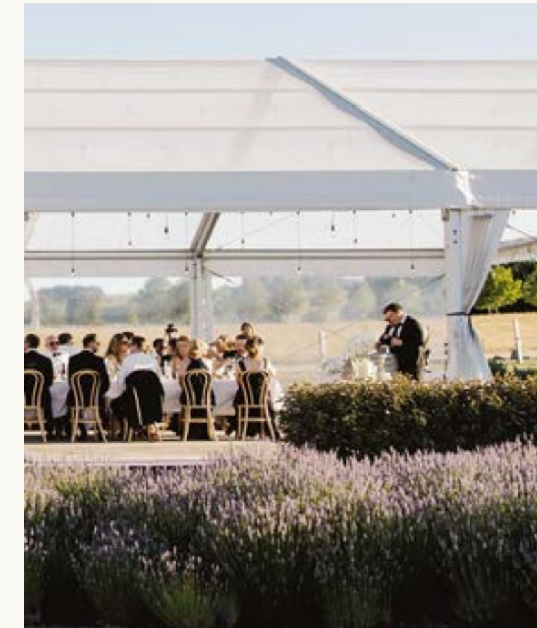
06 / The Marquee