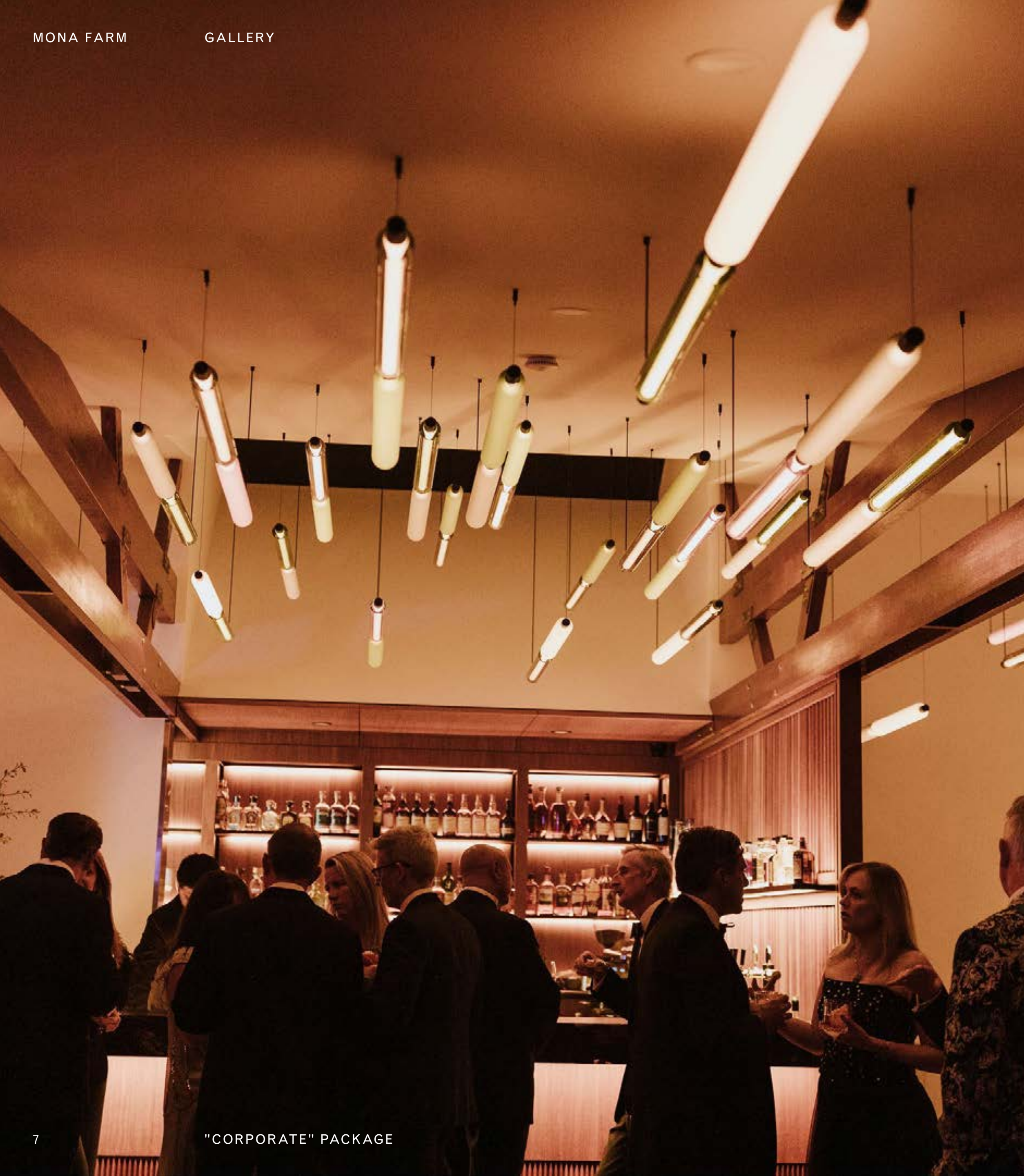
01 / The Woolshed Bar