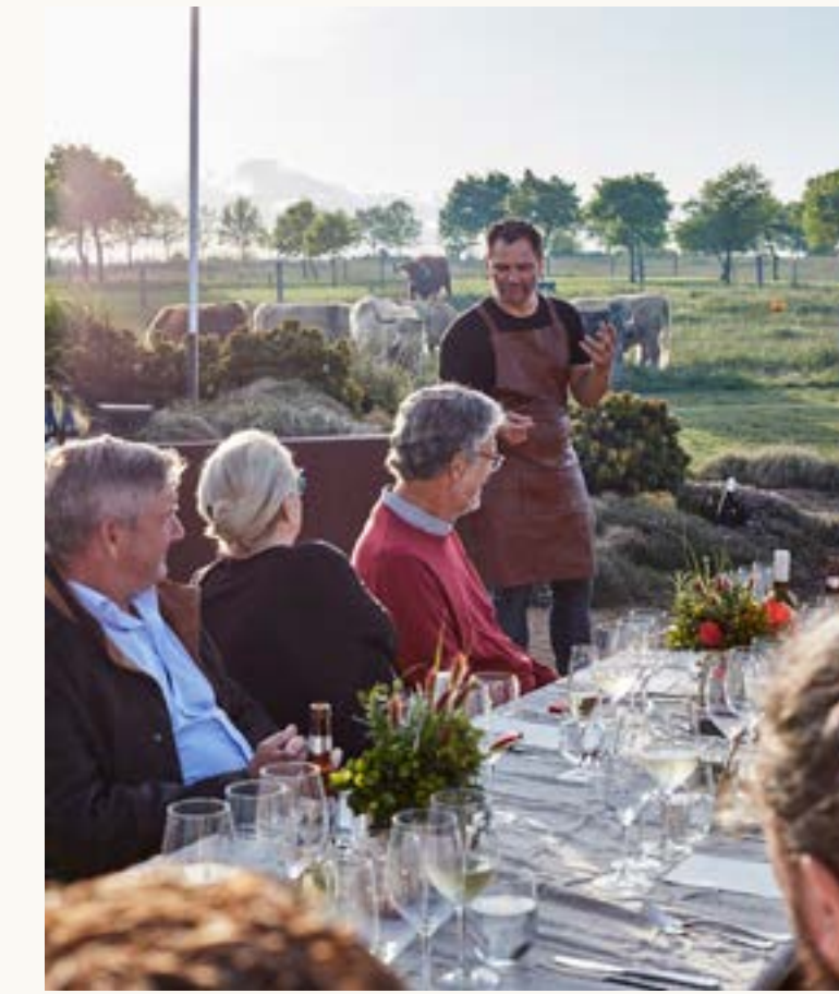
02 / The Woolshed Gardens