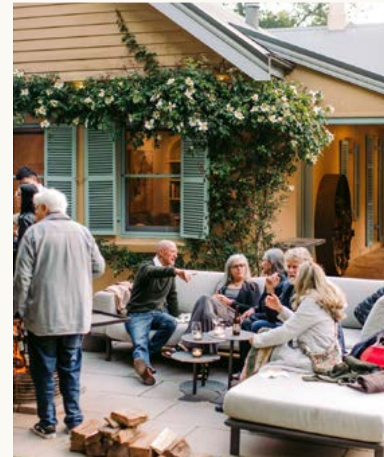
04 / The Homestead