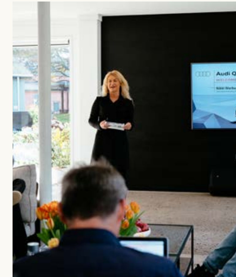
05 / The New Stables