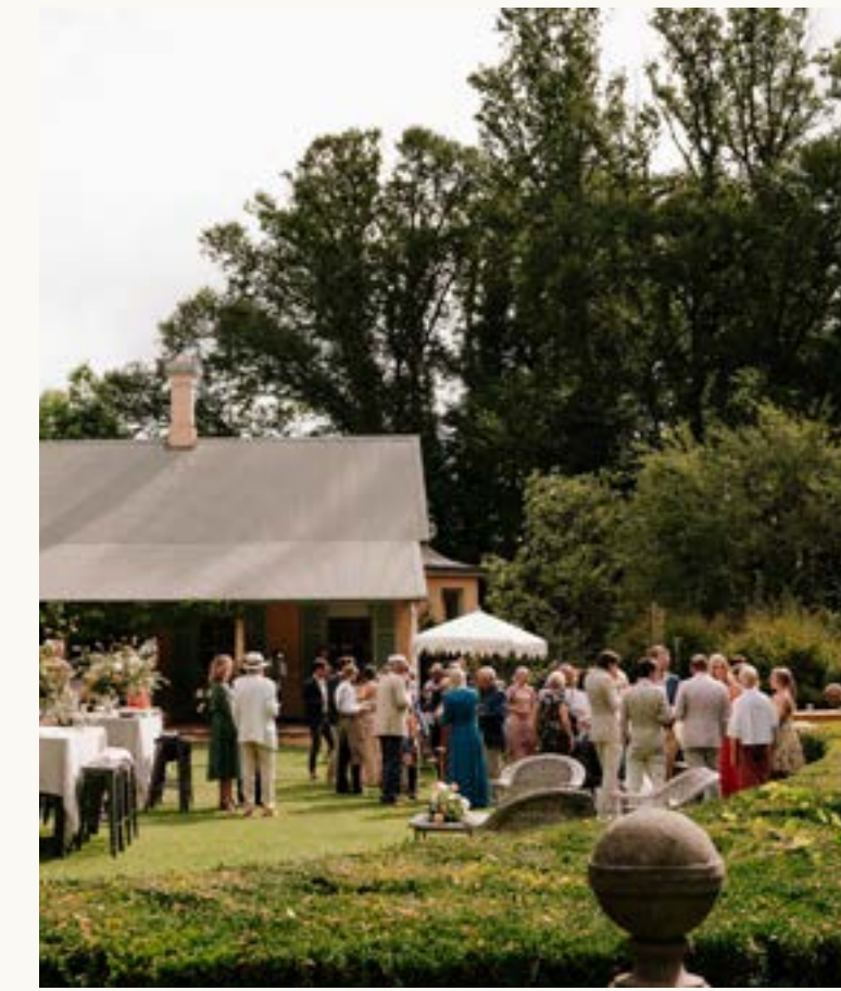
03 / The Homestead Lawn