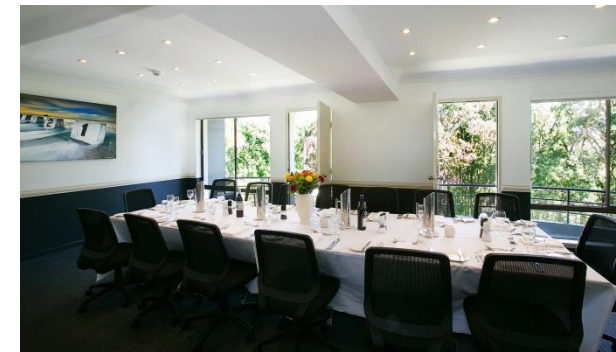
James White Boardroom